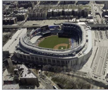
The New Yankee Stadium on March 31st 2009.